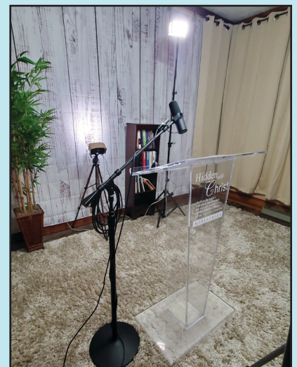
Left: studio - facing the camera Right: studio set from camera side Above: a more professional look for our videos