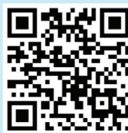
HWCM YouTube Channel