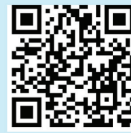
Bethany Projects Website