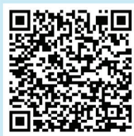
My Everyday Bible for Android